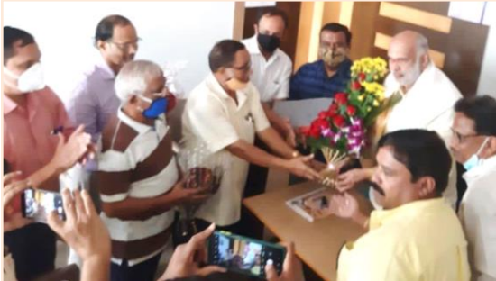
Our community members with Shri Shivaram Hebbar, Honourable Minister in charge of Uttar Kannada District