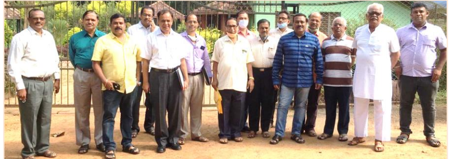
The members of the Caste Working Group at Bangalore where we met officials of various departments and political representatives